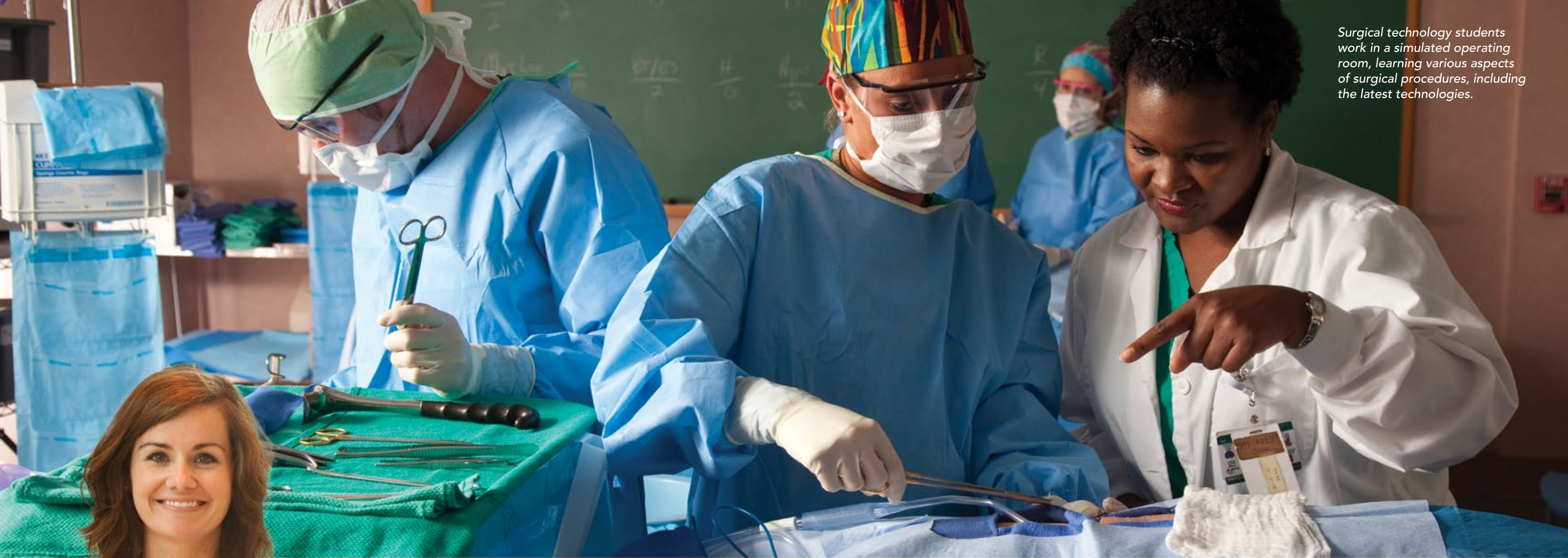
Surgical technology students work in a simulated operating room, learning various aspects of surgical procedures, including the latest technologies.