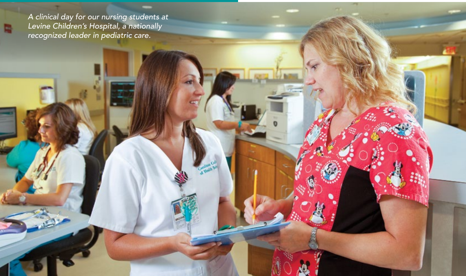
A clinical day for our nursing students at Levine Children's Hospital, a nationally recognized leader in pediatric care.

Our fast-paced phlebotomy program teaches the basics of collecting blood specimens and includes five weeks of class and five weeks of clinical rotations.